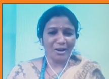
Participation of FPC Members in online seminar by ICAR