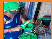
Corona Warriors back in action